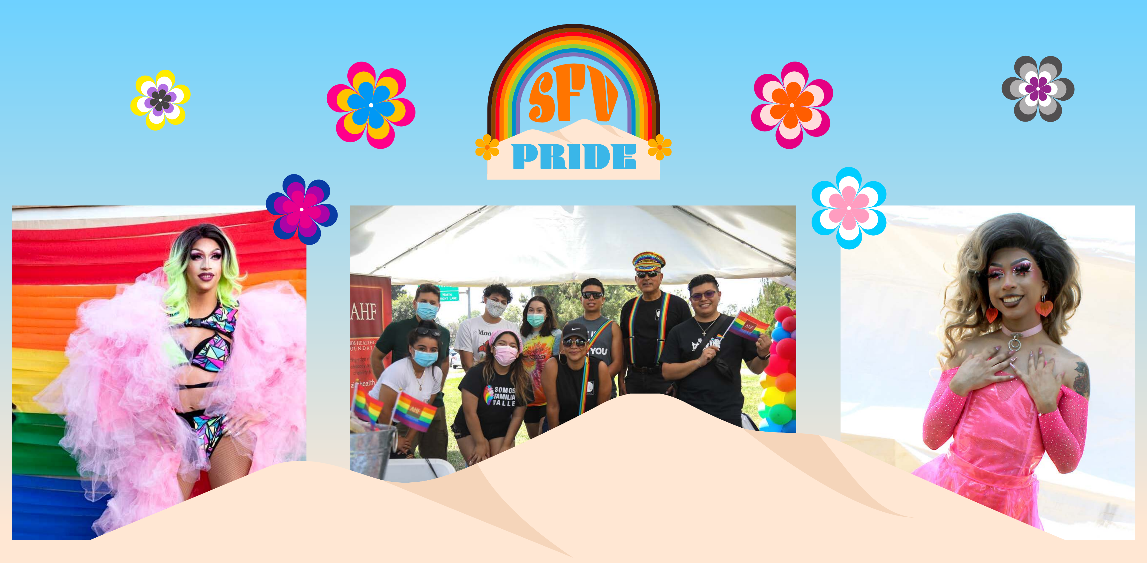
SFV Pride 2023 Sponsorship Deck