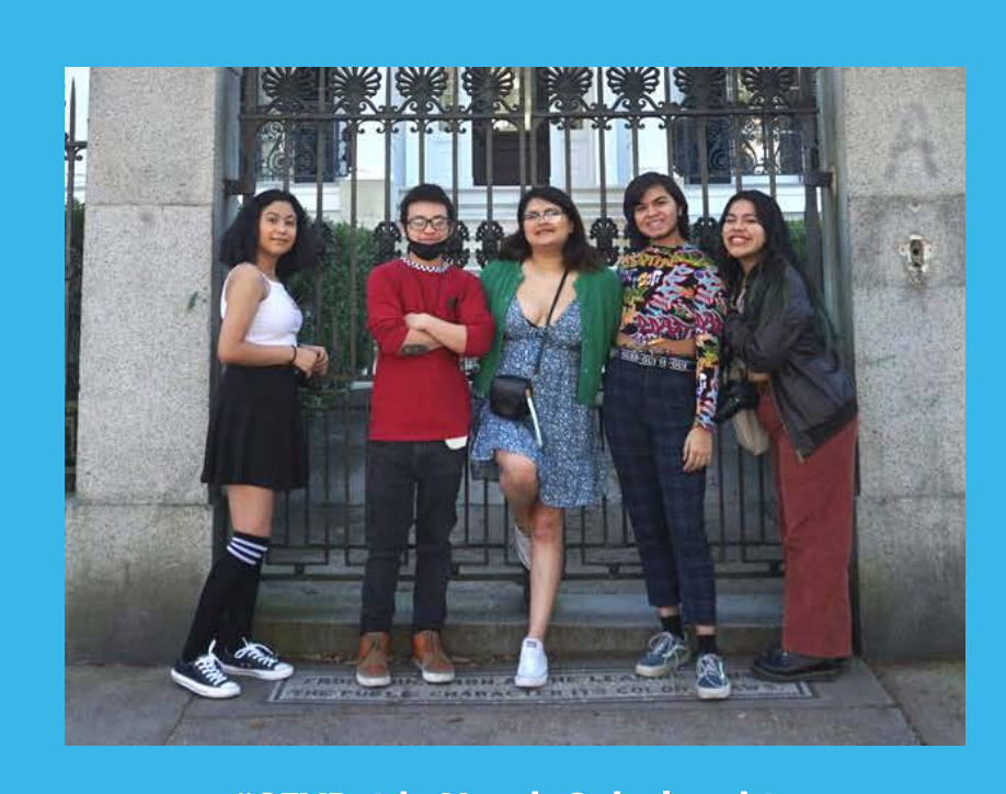
#SFVPride Youth Scholarship